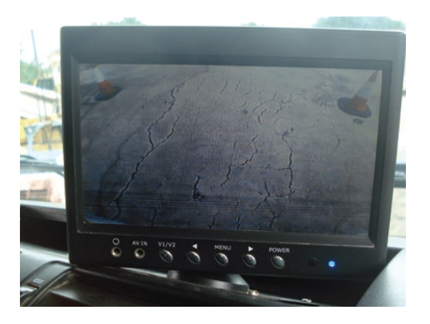
Figure 2 – Typical Image Displayed on Monitor