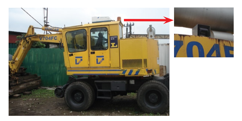
Figure 4 – Camera setup for excavator

8. The camera should be installed at a height not less than 1.5 m as shown in Figure 4. Otherwise more than one camera may be required to achieve the required visibility.