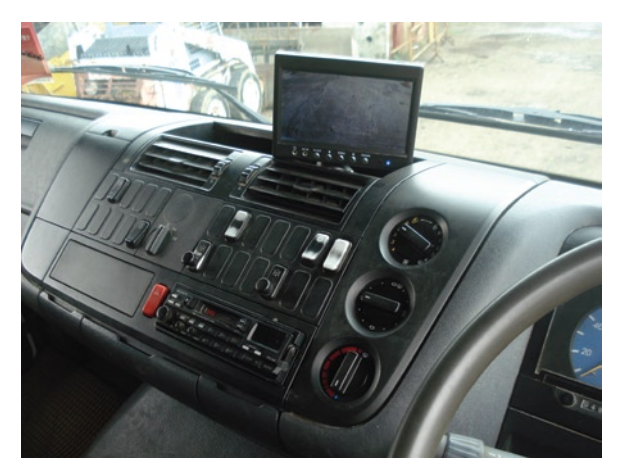
Figure 6 – Position for Monitor

10. The monitor should be installed in operator's cabin at visible locations but should not obstruct vision of normal operation as illustrated in Figure 6.