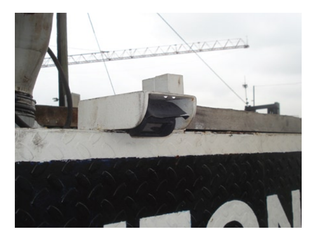
Figure 5 – Mounting Frame for Camera

9. Appropriate mounting frame should be provided for installing and protecting the camera as shown in Figure 5.