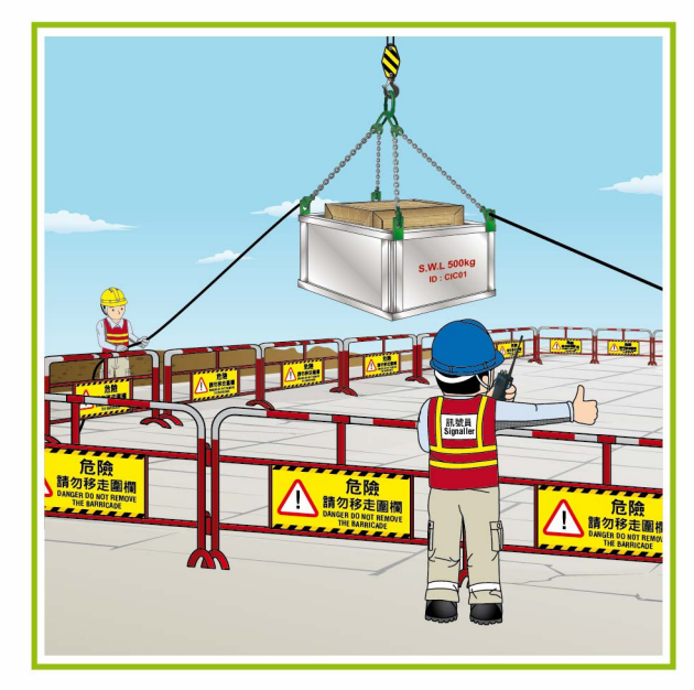
Make sure the tag lines/ropes are properly managed to avoid operators being dangling from the crane.