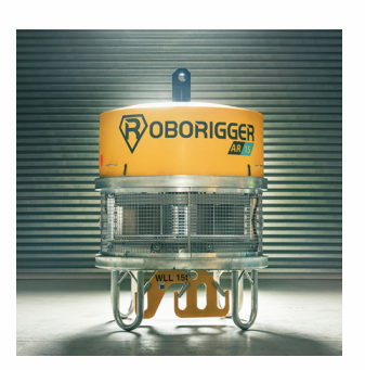
Automated Wireless Load Controlling System