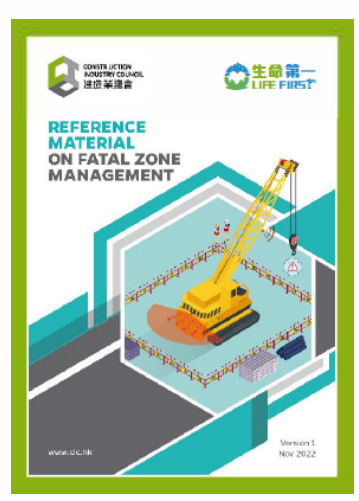
Reference Material on Fatal Zone Management

Reference Material on Safety Roles and Responsibilities of Key Stakeholders in the Hong Kong Construction Industry (Practical Reference Guidance On Lifting Operation)