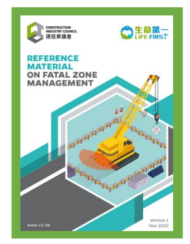
Reference Material on Fatal Zone Management