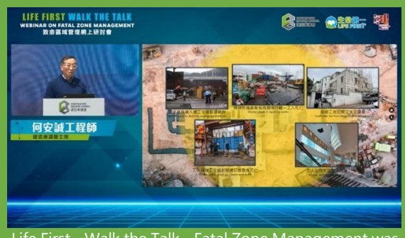
Life First - Walk the Talk - Fatal Zone Management was held on 18 January 2023. Please watch replay of the Webinar at CIC website