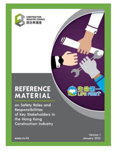
Reference Material on Safety Roles and Responsibilities of Key Stakeholders in the Hong Kong Construction Industry