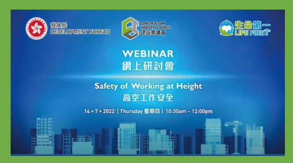
Life First – Walk the Talk – Safety of Working at Height was held on 14 July 2022. Please watch replay of the Webinar at CIC website.