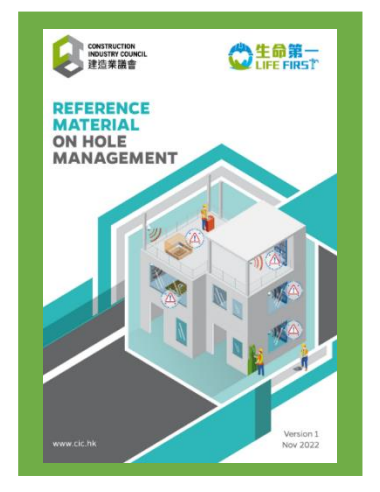
Reference Material – on Hole Management

Reference Material – on Safety Roles and Responsibilities of Key Stakeholders in the Hong Kong Construction Industry