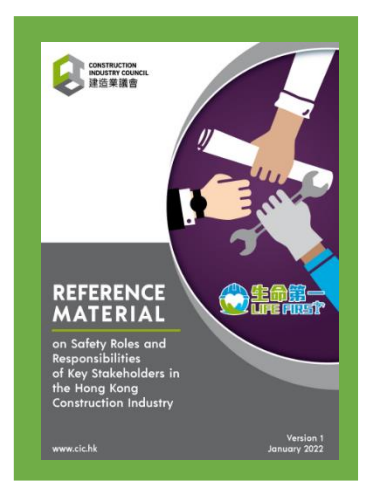
Reference Material on Safety Roles and Responsibilities of Key Stakeholders in the Hong Kong Construction Industry