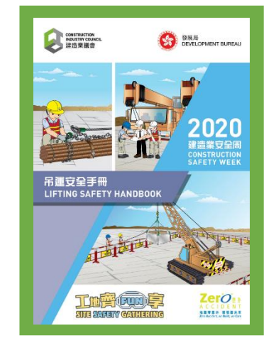
Lifting Safety Handbook