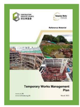
Reference Material on Temporary Works Management Plan