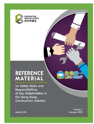
Reference Material on Safety Roles and Responsibilities of Key Stakeholders in the Hong Kong Construction Industry