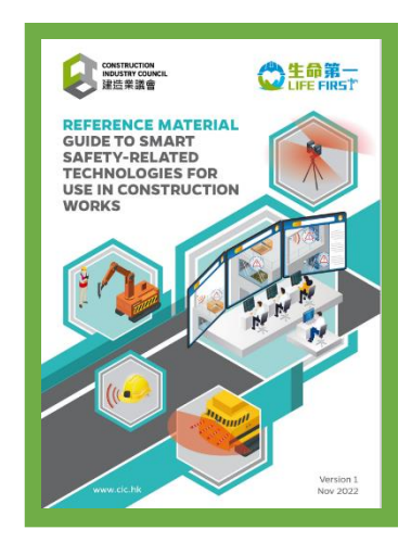
Reference Material - Guide to Smart Safety-Related Technologies for Use in Construction Works