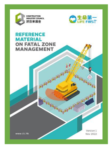
Reference Material on Fatal Zone Management