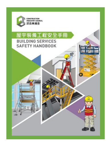
Building Services Safety Handbook