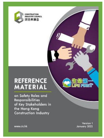
Reference Material on Safety Roles and Responsibilities of Key Stakeholders in the Hong Kong Construction Industry