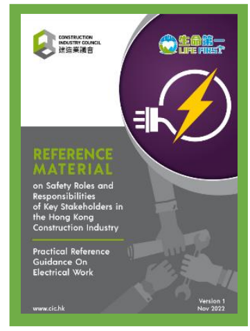
Reference Material on Safety Roles and Responsibilities of Key Stakeholders in the Hong Kong Construction Industry (Practical Reference Guidance On Electrical Work)