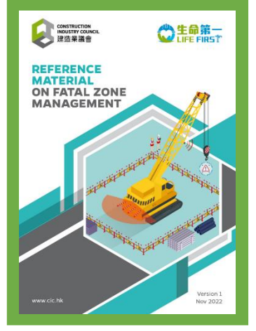
Reference Material on Fatal Zone Management