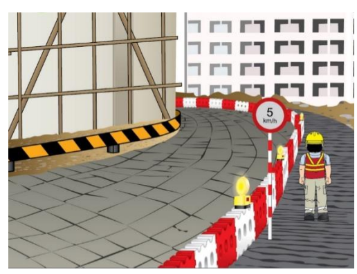
Continuous barriers along access as segregation