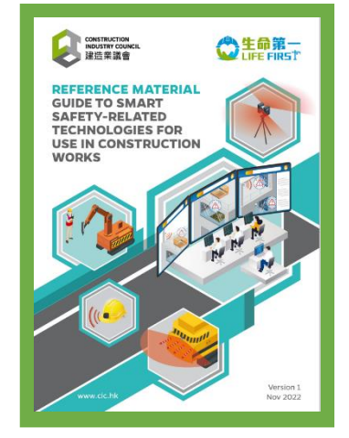
Reference Material - Guide to Smart Safety-Related Technologies for Use in Construction Works