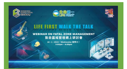
Life First - Walk the Talk "Webinar on Fatal Zone Management" was held on 18 January 2023. Please watch replay at CIC website. (Chinese Version only)