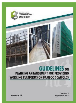
Guidelines on Planking Arrangement for Providing Working Platforms on Bamboo Scaffolds