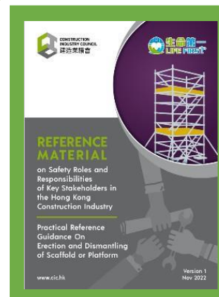
Reference Material on Safety Roles and Responsibilities of Key Stakeholders in the Hong Kong Construction Industry (Practical Reference Guidance On Erection and Dismantling of Scaffold or Platform)