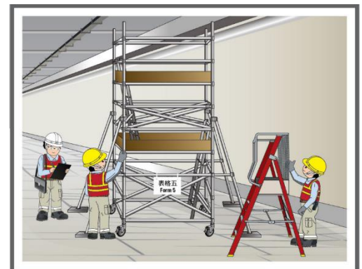
Suitable working platforms (e.g. light-duty working platforms or mobile working platforms) should be provided and used