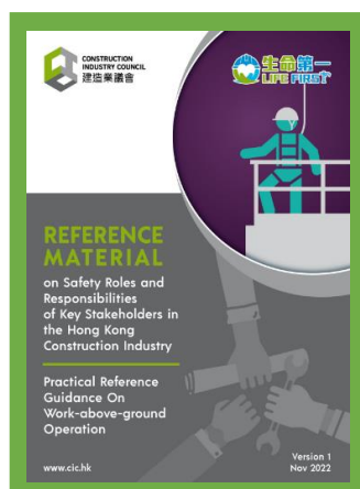
Reference Material on Safety Roles and Responsibilities of Key Stakeholders in the Hong Kong Construction Industry (Practical Reference Guidance On Work-above-ground Operation)