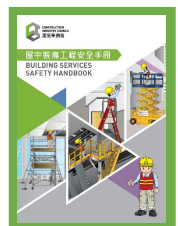
Building Services Safety Handbook