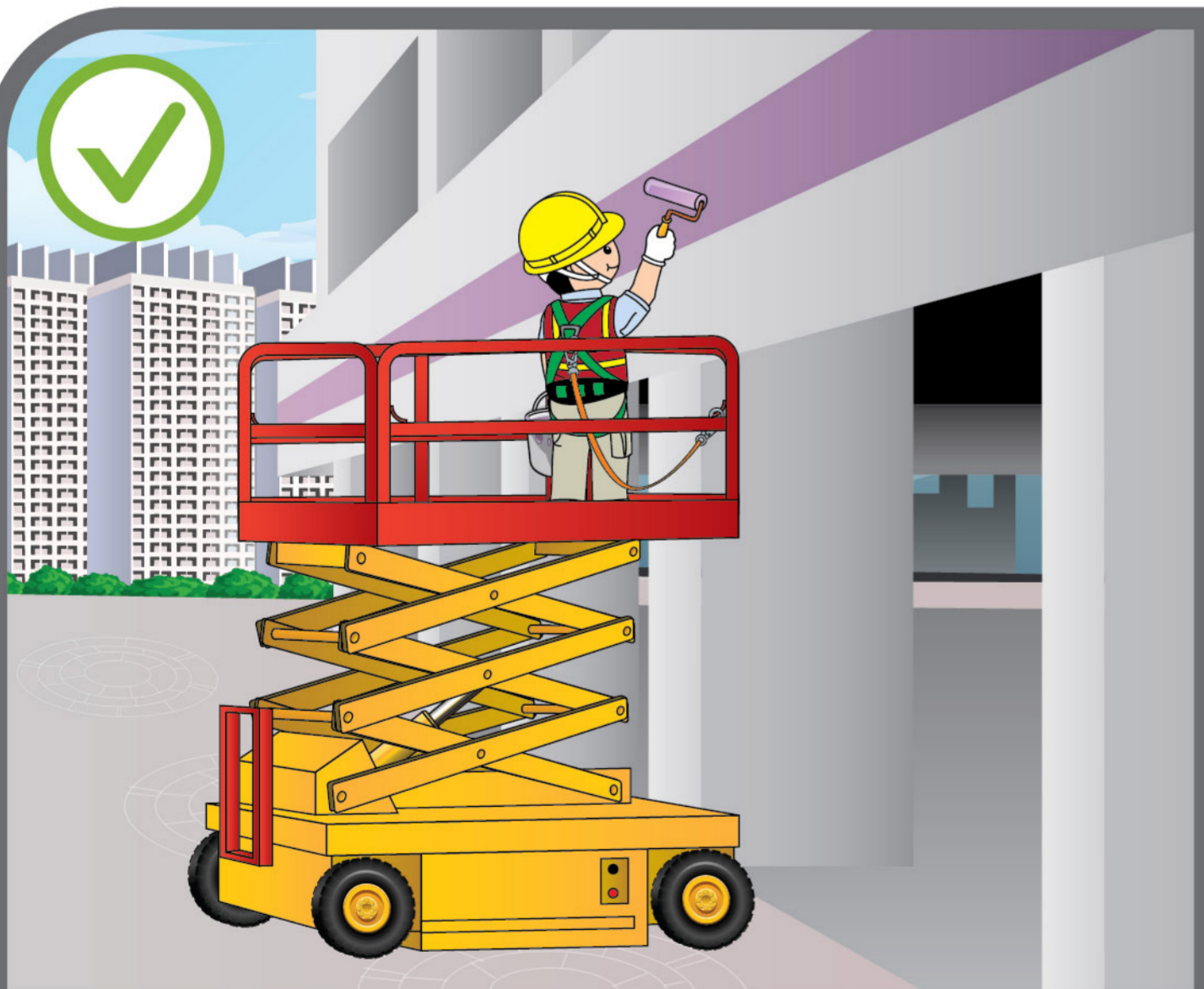
Use a proper elevated working platform.