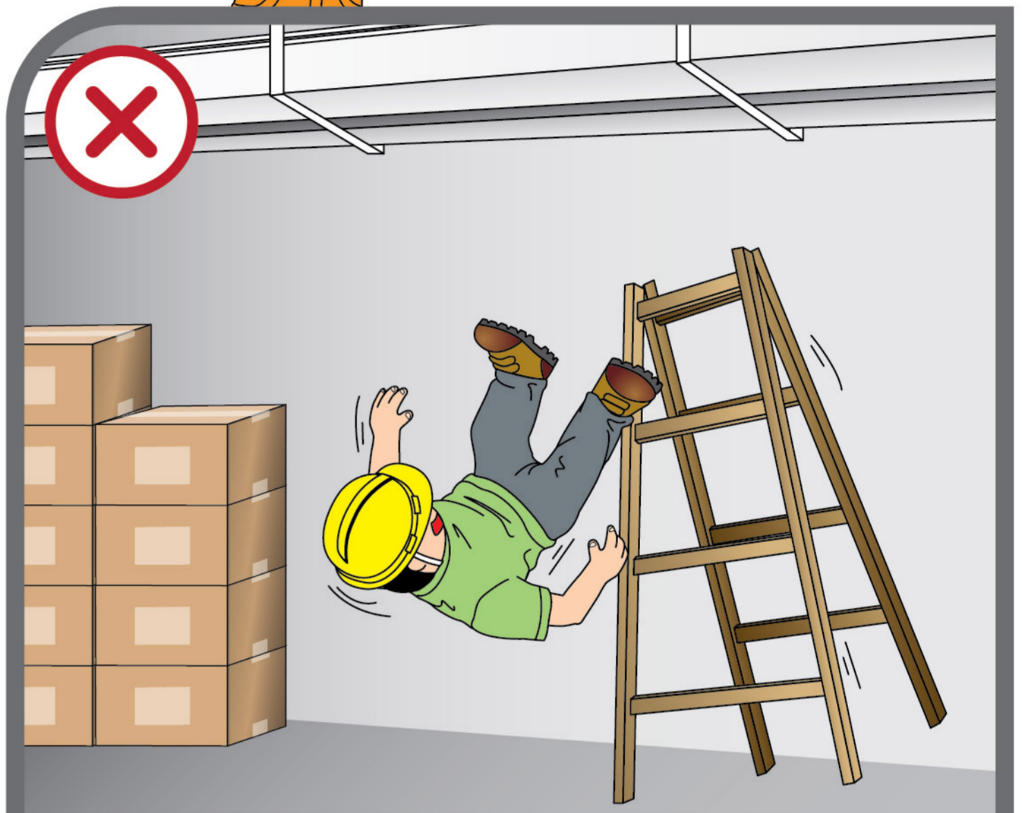
Don't use A-shaped ladder. Use suitable working platform.