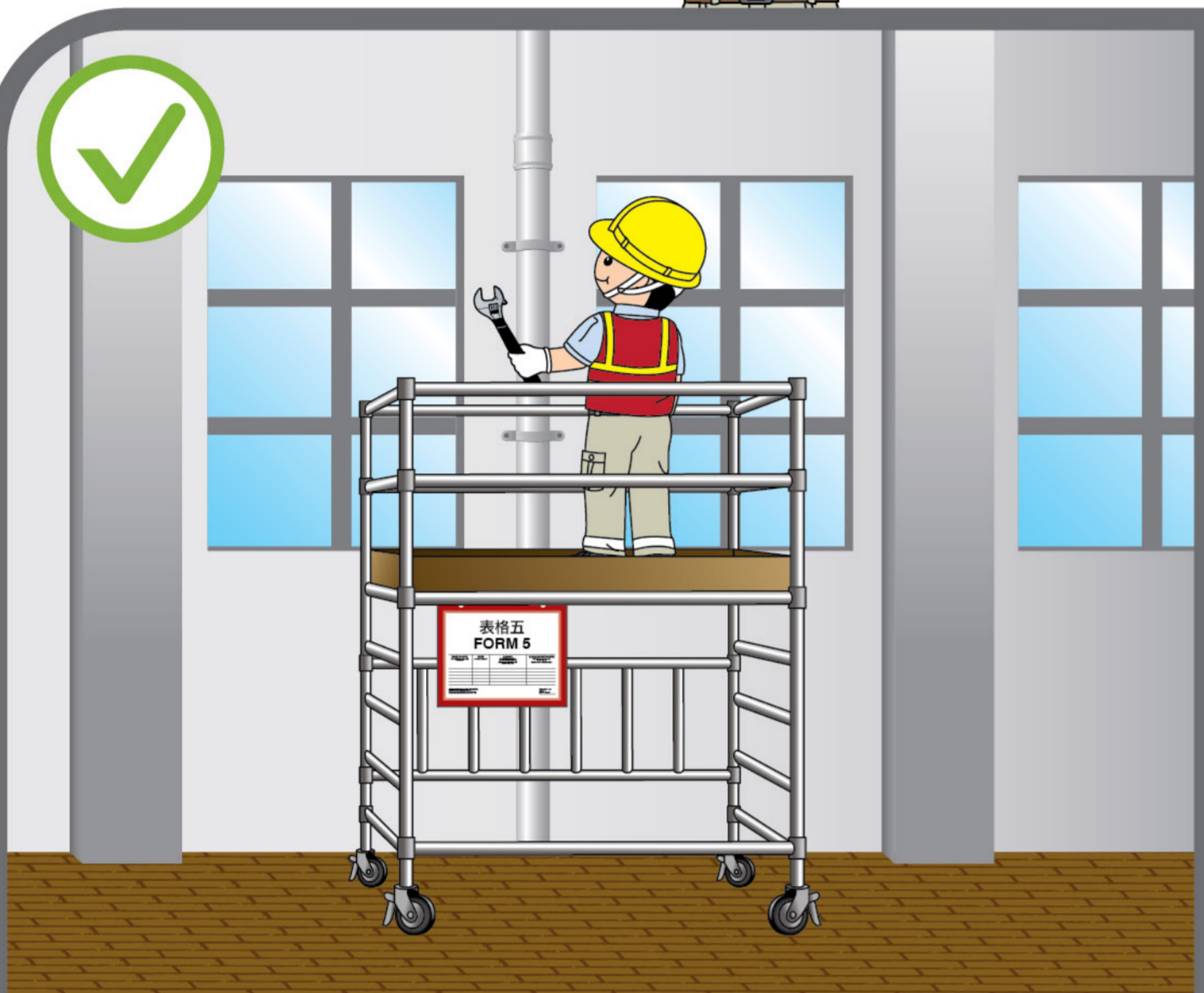
Use working platform that complies with safety standards.