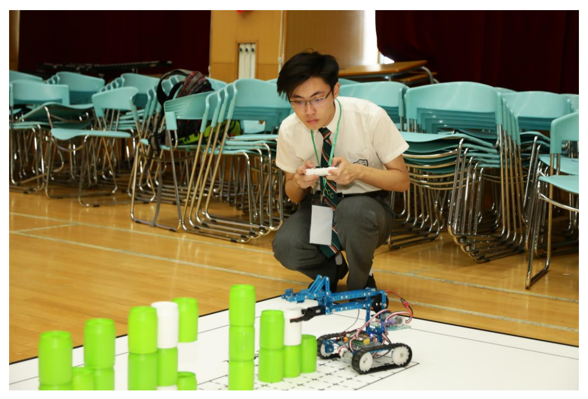
Participants focus on building "HKIC" building by using the prefabricated components