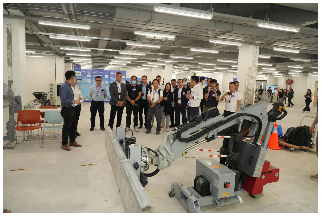
Industry Stakeholders actively participate in the Workshops on Construction Robots