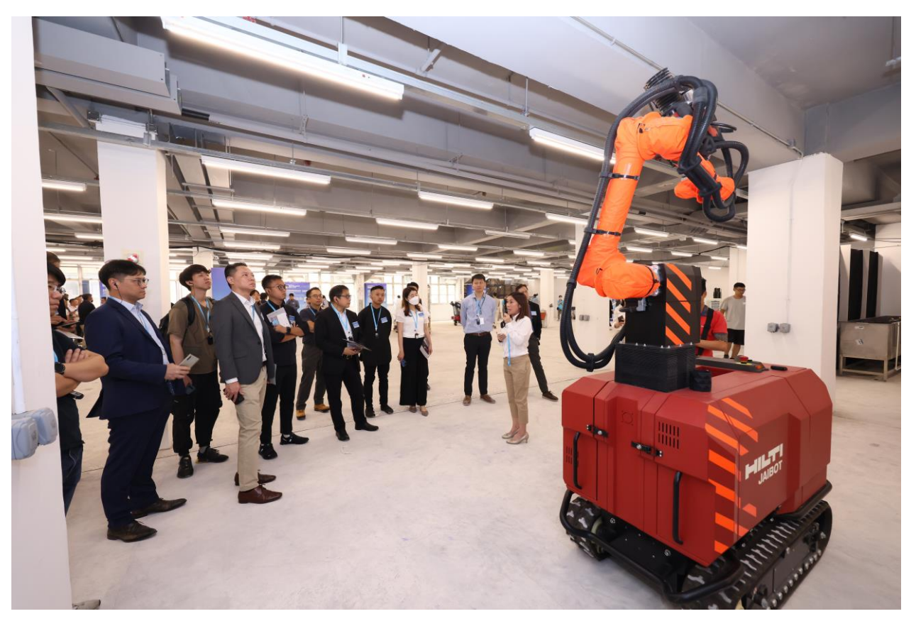
Industry Stakeholders actively participate in the Workshops on Construction Robots