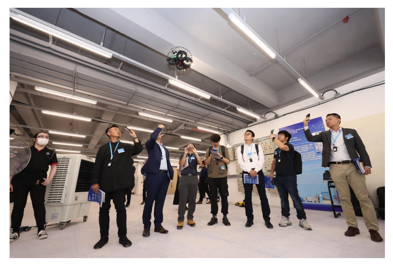
Industry Stakeholders actively participated in the Workshops on Construction Robots