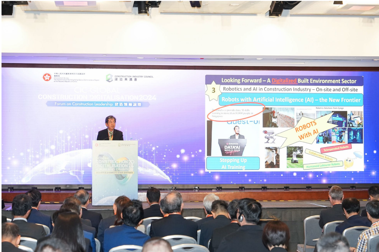
The forums on Construction Leadership and Smart Project Delivery have successfully concluded today, while the forums on Future Construction and Smart Building Asset will be held tomorrow