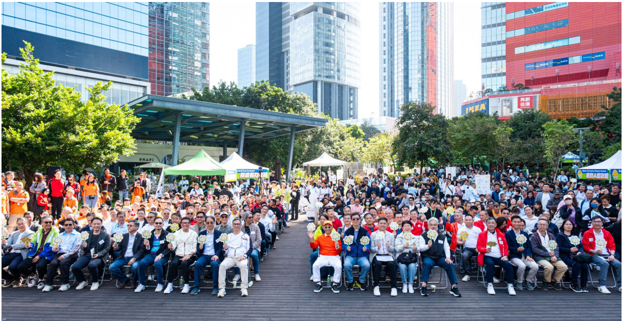
Construction Workers Festival Carnival is participated by over 6,000 construction workers and their family members