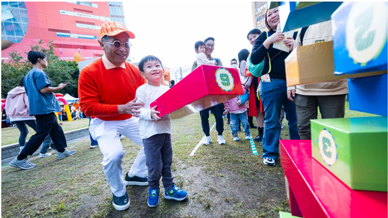
The Carnival features game booths to promote construction safety