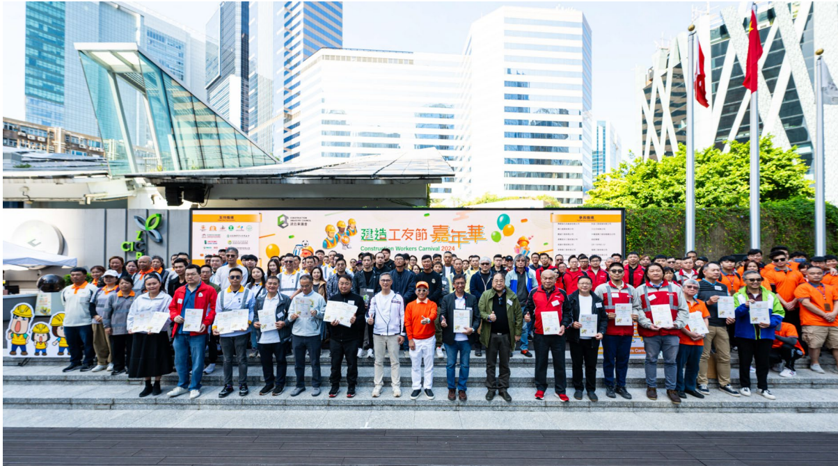
The CIC appreciates the achievements and contributions of frontline workers