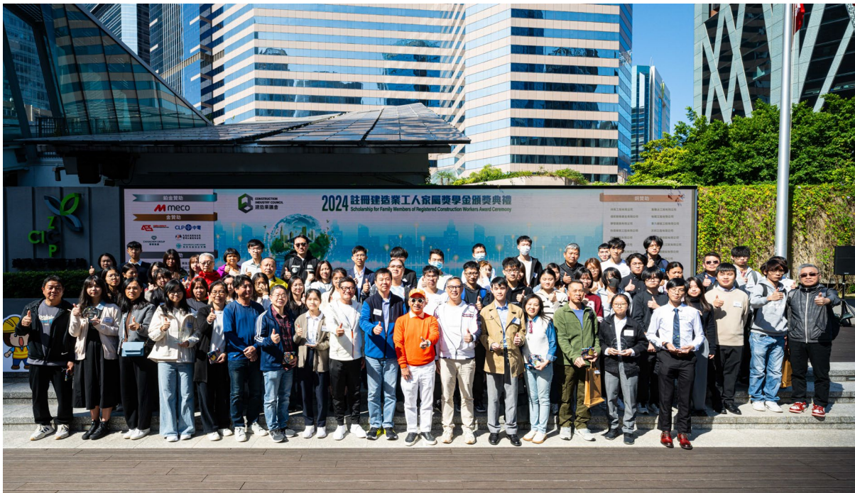
The Award Ceremony of the 14th Scholarship for Family Members of Registered Construction Workers is also held at the Carnival