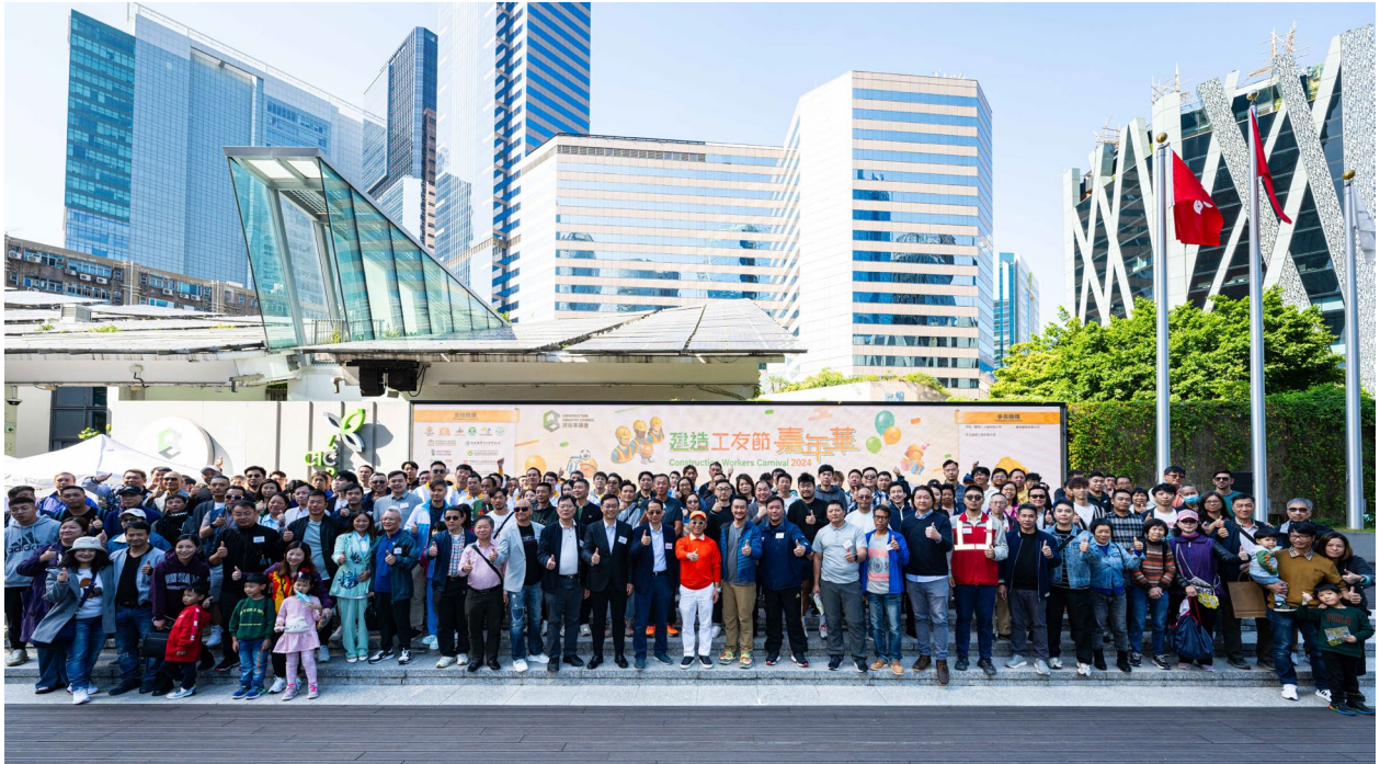
Amidst an atmosphere brimming with joy, all guests, workers and their family members immerse in this unforgettable occasion, sharing the joyful moments together