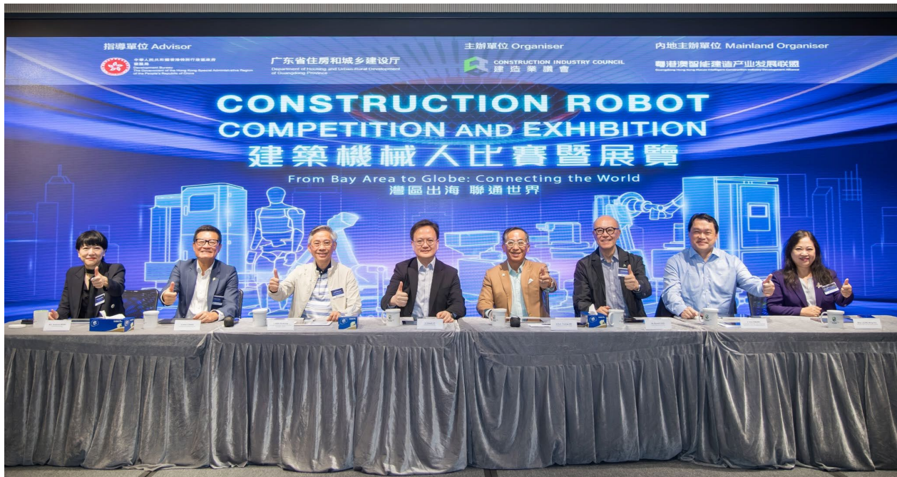
Judges of the Construction Robot Challenge