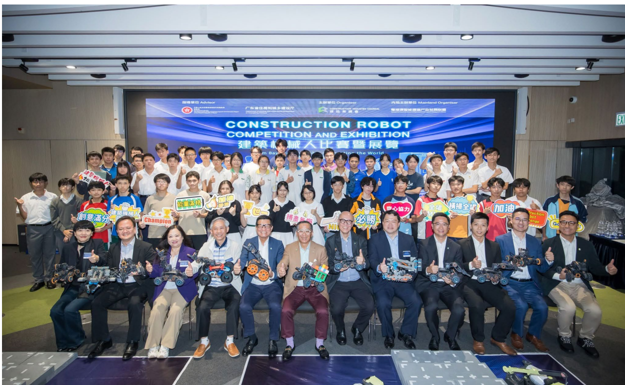
Group photo of judges, guests and 12 school teams at the Construction Robot Challenge