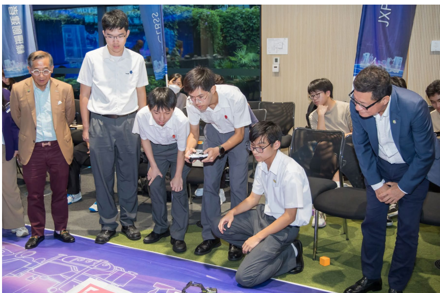
Construction Robot Challenge on-site competition