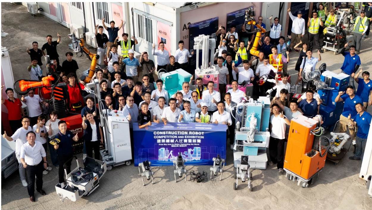
Group photo of Judges and participating robot companies at the Construction Robot Practical Competition