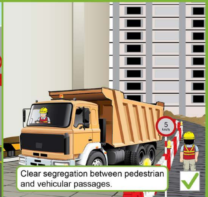
Clear segregation between pedestrian and vehicular passages.