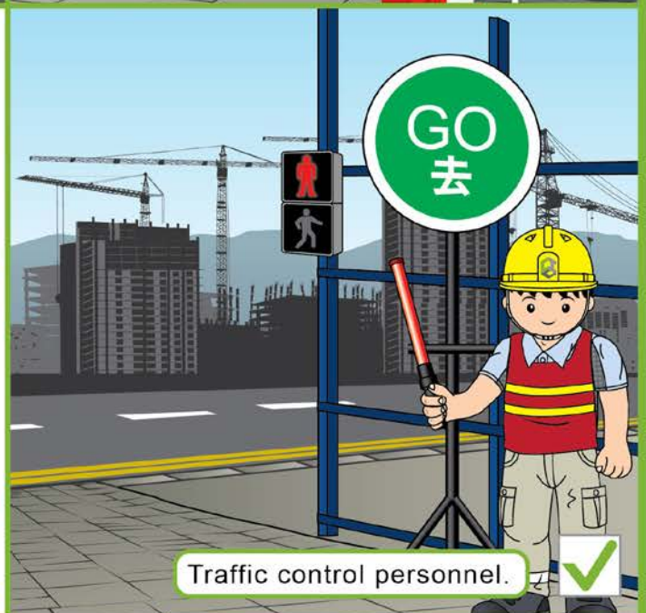
Traffic control personnel.