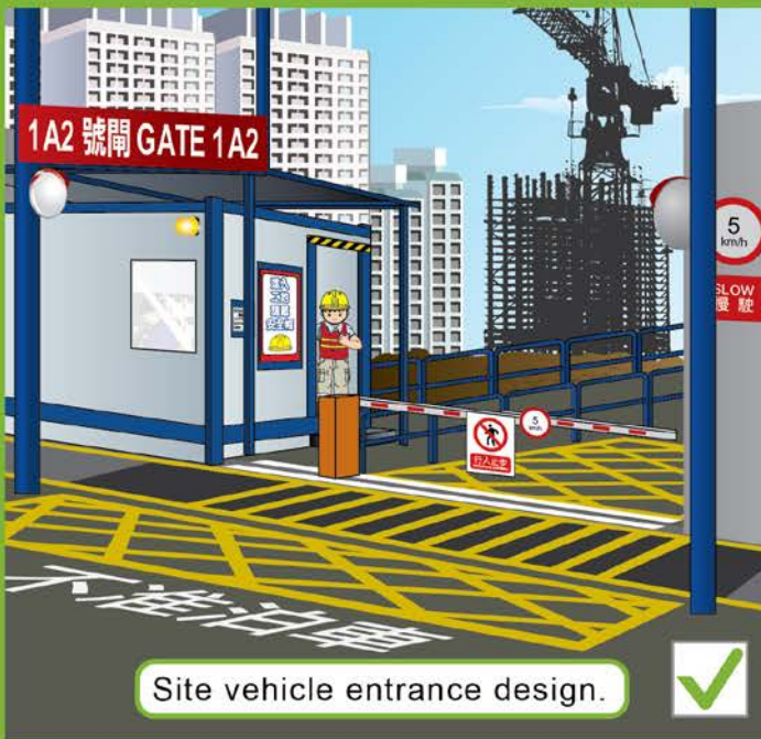
Site vehicle entrance design.